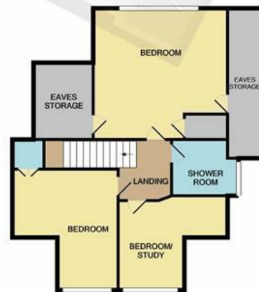
1ST FLOOR APPROX. FLOOR AREA 652 SQ.FT. (60.5 SQ.M.)