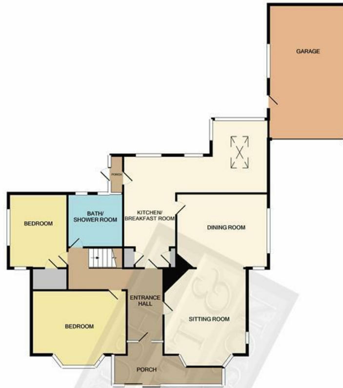
GROUND FLOOR APPROX. FLOOR AREA 1441 SQ.FT. (133.9 SQ.M.)